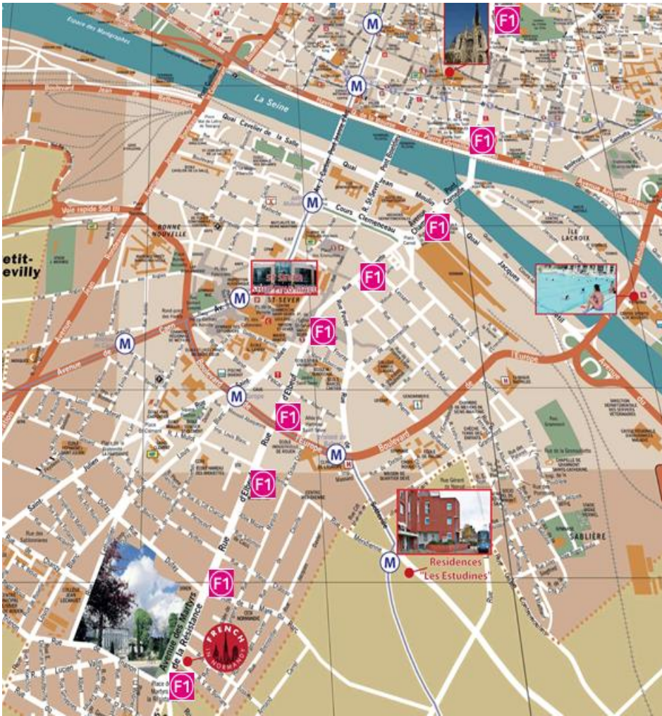
Red line shows route from the Residence to the school